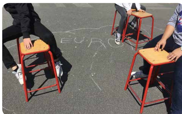
Students representing the European population and its wealth.

5. Using the second table provided in WORKSHEET E3.1, inform the students about the true distribution of wealth. Move the chairs to different continents as needed. Ask the students to sit on a chair without