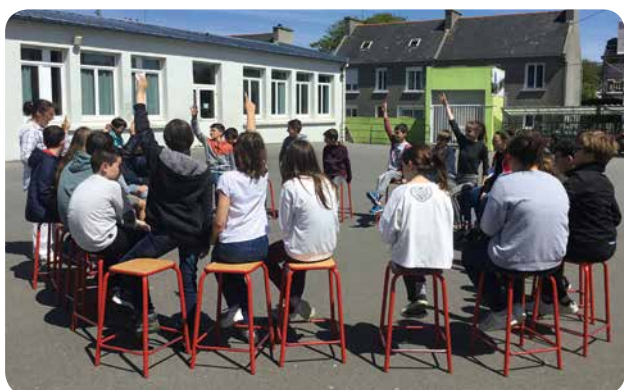
Students in a circle, outdoors.

1. Ask the students to form a standing circle: They shall represent the (almost) 8 billion earthlings. You may choose gender to explain the concept of the following activity. Discuss what proportion of the world is male and what proportion is female and ask the students to divide themselves accordingly. The 8 billion people in the world can roughly be divided into 4 billion females and 4 billion males. Half the class should stand on one side of the room and half the class on the other side (regardless of actual gender).