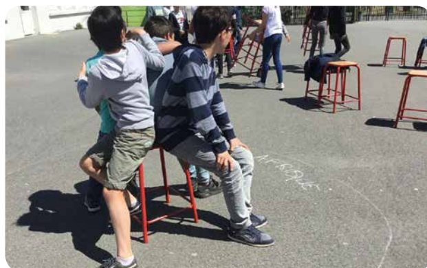
Students representing the African population and its wealth.

4. Each student now retrieves a chair and sits around his/her assigned continent label as a small group. Tell the students that all of their chairs combined represent the wealth of the world. In their groups, the students discuss how they think the chairs (wealth) are divided amongst all the people of the world in each continent. Each group shares their thoughts with the rest of the class. The class decides together if some chairs should be moved to a different continent. The chairs are moved as the class thinks is appropriate. Remember, the students do not move with the chair but stay with their continent.