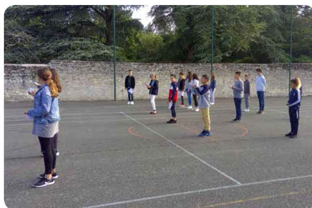
Forwards and backwards with climate change.

11. Discuss with the students who in the world is most vulnerable to climate change and why.